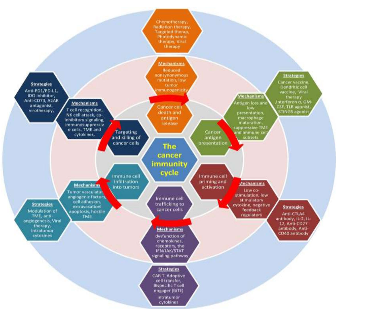
Fig. 2 The cancer-immunity cycle, resistant mechanisms and potential solutions